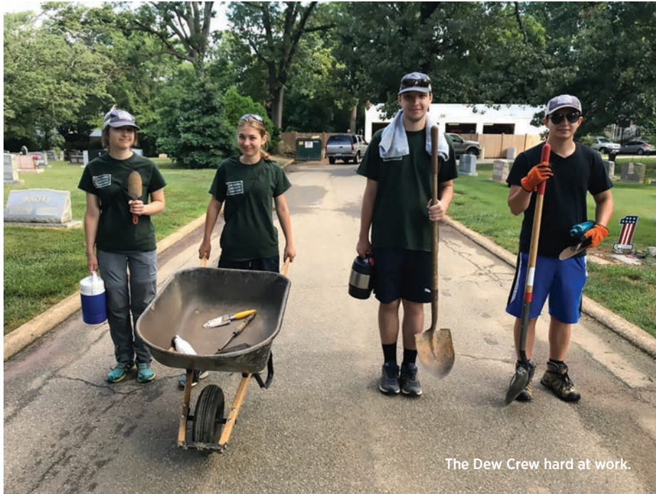
The Dew Crew hard at work.