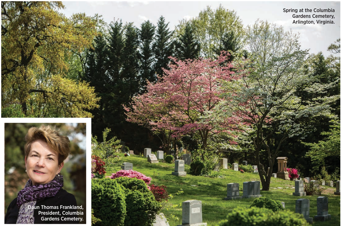
Spring at the Columbia Gardens Cemetery, Arlington, Virginia.