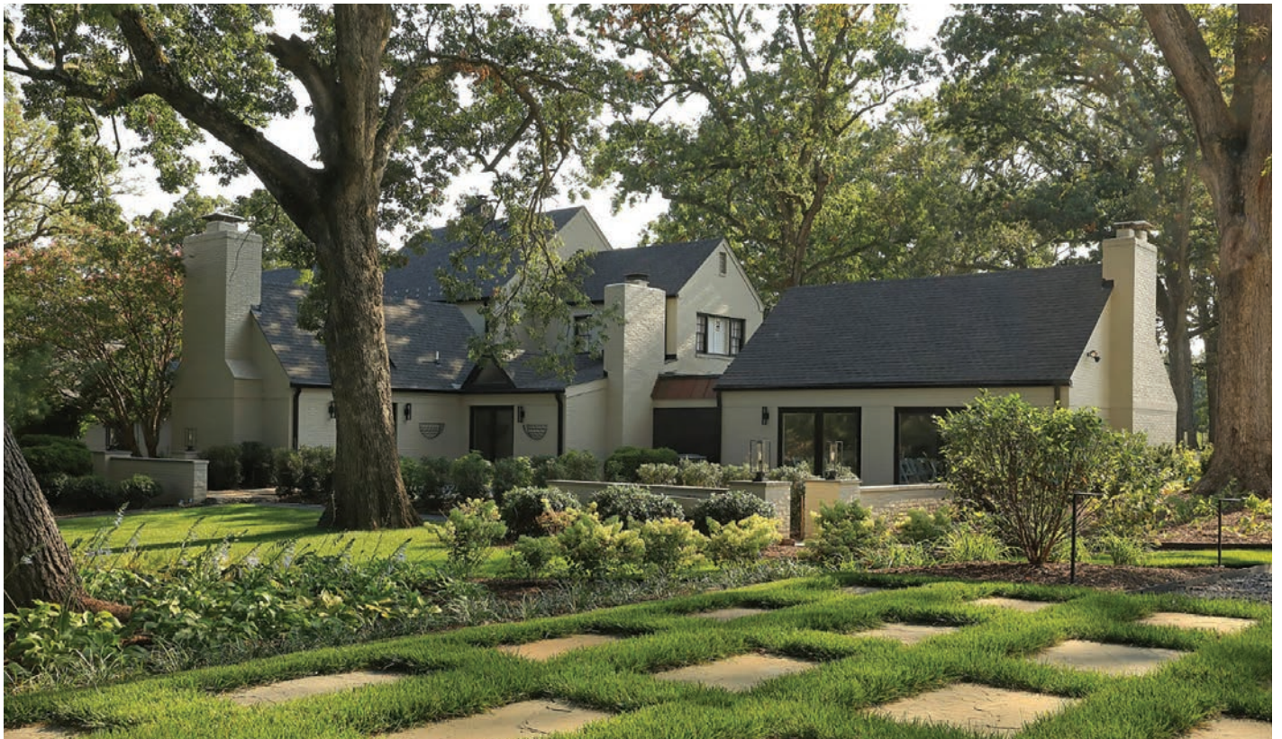
The new Indoor/outdoor Event Center for family gatherings.